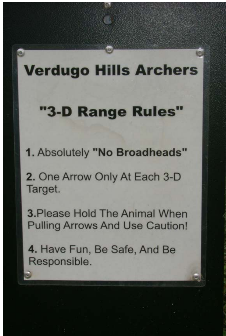
The above sign is posted at each 3D Target